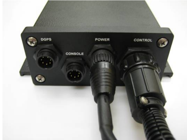
Fig. 3: AutoMate console

Important: If the conditions of step 5 are met, AutoMate will begin to spray if 1) AutoMate recognizes that it is in an un-applied area and 2) AutoMate recognizes a positive ground speed.