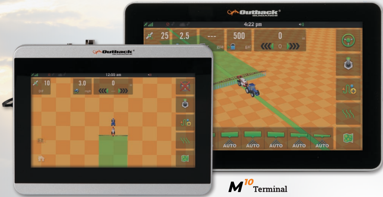
M 7 Terminal